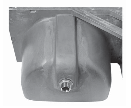
Photograph details integral overflow and drain assembly. Drain assembly included with bath.